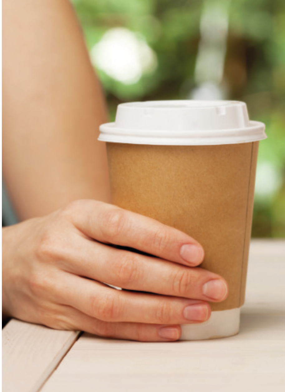
Reliable bonding and packaging solutions – even for the most demanding challenges